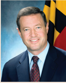
Martin J. O'Malley Governor (D) State House, 100 State Circle Annapolis, MD 21401 (410) 974-3901 governor@gov.state.md.us