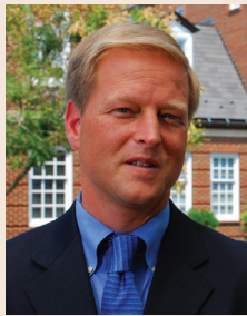
Frank Kratovil Congressman (D) 1st Congressional District 314 Cannon HOB Washington, DC 20515 (202) 225-5311 http://kratovil.house.gov