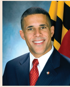
Anthony G. Brown Lt. Governor (D) State House, 100 State Circle Annapolis, MD 21401 (410) 974-3901 ltgovernor@gov.state.md.us