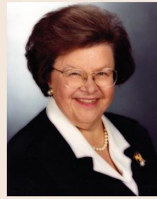
Barbara A. Mikulski US Senator (D) 1629 Thames Street, Ste 400 Baltimore, MD 21231 (410) 962-4510 www.Mikulski.senate.gov